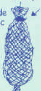
food in a net bag

Why not invent your own bird feeders! All of these can be hung from trees or suspended from your bird table.