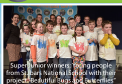
Super Junior winners: young people from St. Ibar's National School with their project 'Beautiful Bugs and Butterflies'