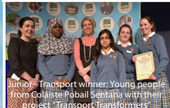
Junior - Transport winner: Young people from Coláiste Pobail Sentana with their project 'Transport Transformers'