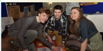
Some of the finalists pictured at the YEA 2015

For more information on ECO-UNESCO's YEA contact yea@ecounesco.ie or visit www.ecounesco.ie .