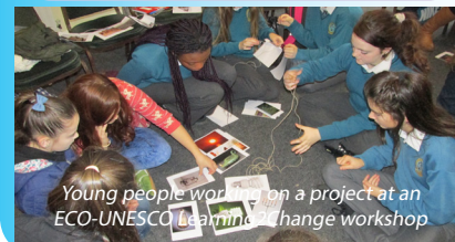
Young people working on a project at an ECO-UNESCO Learning2Change workshop

Is your school inspired to make a change? Then e-mail us at learning2change@ecounesco.ie !