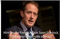
Minister for Foreign Affairs Sean Sherlock TD during his keynote address