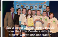
Super Junior winners: Young people from The Little Monsters with their project 'Operation Cooperation'