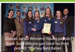
Overall Junior Winners: Young people from Scoil Mhuire gan Smál for their project 'Blarney Bats Babes'