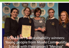
ECO Art & Sustainability winners: Young people from Moate Community School with their project 'Mediva'