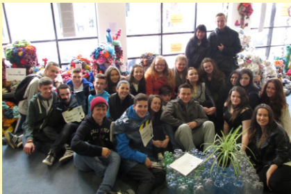
Y-PEPS pictured at the Greenhouse

Join Us! We welcome young people to our YSD Programme each October. E: ysd@ecounesco.ie Come to the Greenhouse and make new friends, learn about sustainability and the environment, embark on outdoor adventures and learn how to take action to raise awareness amongst your peers!