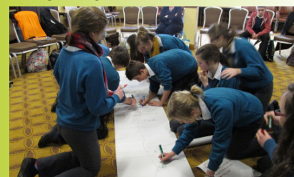
Young people working on a project at an ECO-UNESCO Learning2Change workshop

Get involved! For more information contact learning2change@ecounesco.ie