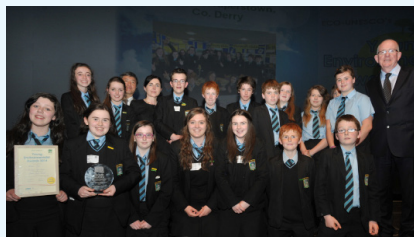
(L) Senior Winners of the YEA 2014 'Yes We Can' from Kiltimagh, Co. Mayo and (R) Junior Winners of the 2014 YEA 'Susan's Trail' from Draperstown, Co. Derry.