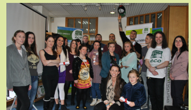
Green Pathways participants pictured at their Graduation with ECO-UNESCO staff