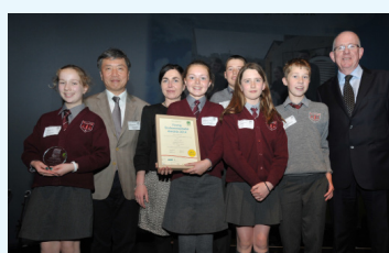
Joint Super Junior Winners; 'These Boots are Made for Walking', Co. Wexford (L) and 'Non Native Forestry Plantations', Co. Cork (R).