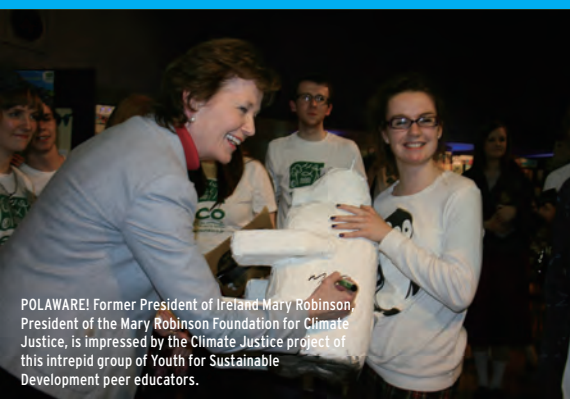
POLAWARE! Former President of Ireland Mary Robinson, President of the Mary Robinson Foundation for Climate Justice, is impressed by the Climate Justice project of this intrepid group of Youth for Sustainable Development peer educators.

Get Involved! Contact youth@ecounesco.ie or see www.ecounesco.ie for a calendar of exciting events and activities for young people.