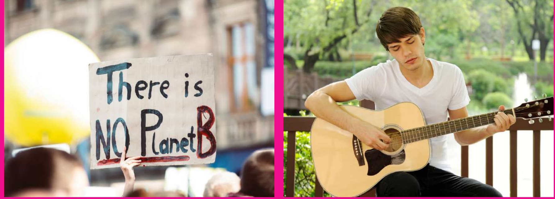
Lead a flash mob