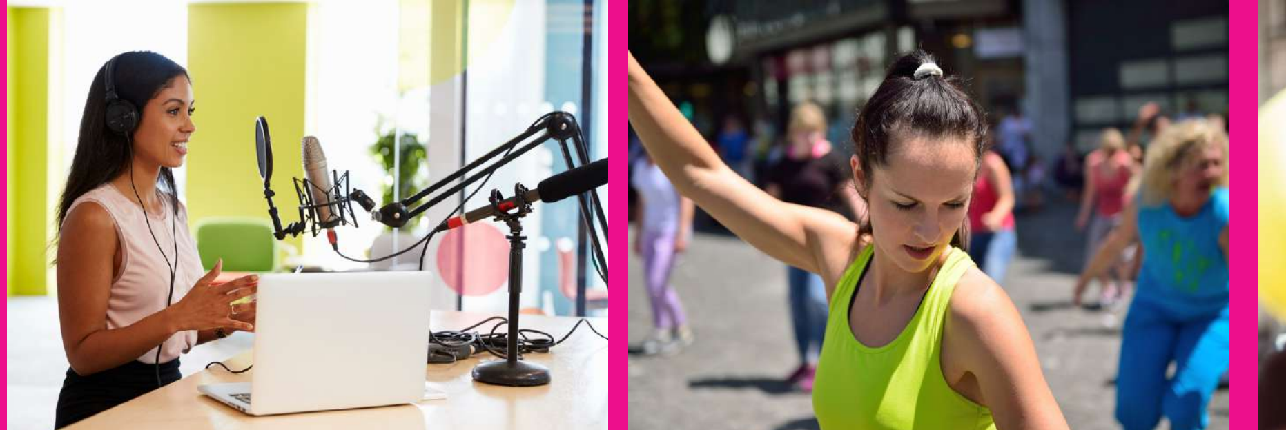
Create a podcast