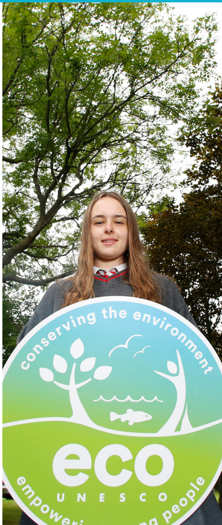
Young Environmentalist Awards participant