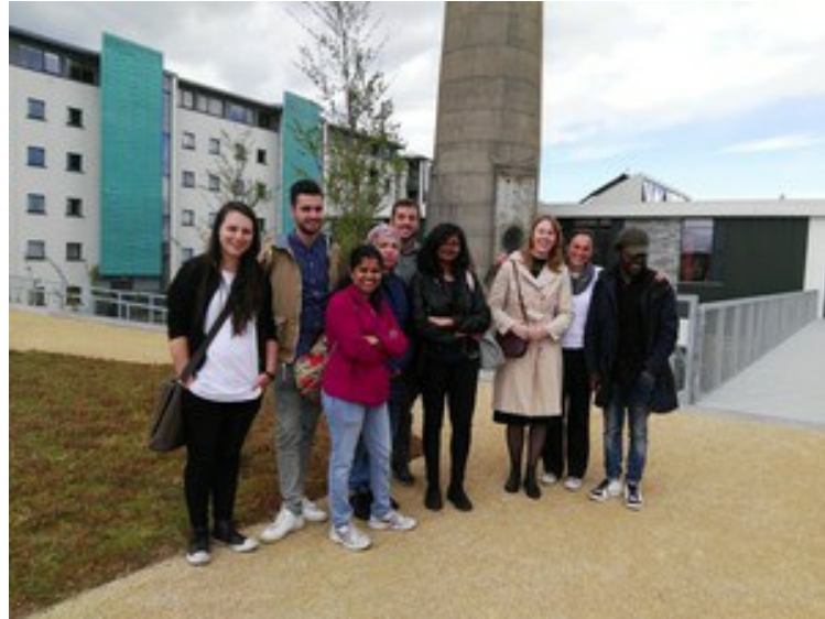
Photo: Green Skills participants at the Rediscovery Centre

Earlier in May participants in the Green Skills programme attended mock job interviews with experienced Accenture staff. This experience is invaluable to the participants which has helped improve their employability as they move forward with their search for work. All were happy with their feedback! The group are now on their 5 week work placement in a variety of green companies and organisations across Dublin. We wish them all the best in their placements.