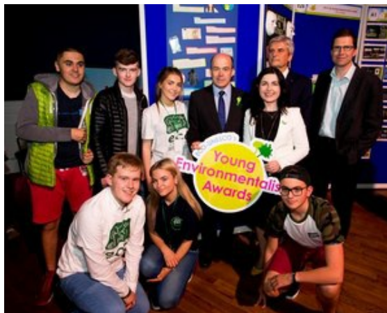
Picture: young people meeting Minister Denis Naughten at the YEA Final

Young people from the Youth for Sustainable Development programme spent a lot of time this month preparing projects and displays for the YEA Showcase and Awards Ceremony. They were delighted to meet Minister Denis Naughten and the Dublin Lord Mayor at the event and tell them about how they've been taking action to protect and raise awareness of environmental issues.