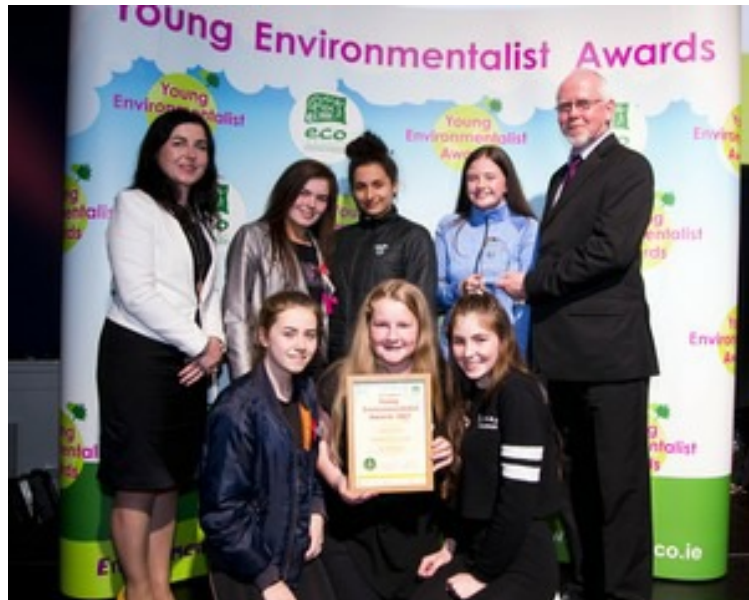
Picture: young people from Stoneybatter Youth service win the Junior Waste Award

May was a busy month for Eco-Choices, as the groups that began in March are in full swing, and last year's groups are busy attend the Young Environmentalist Awards. Two of their projects, "Binning = Winning" and "Cycle Against Racism" picked up the Junior Waste Award and Senior ECO-Community Development Awards respectively. Congratulations to all the young people whose hard work and determination paid off!